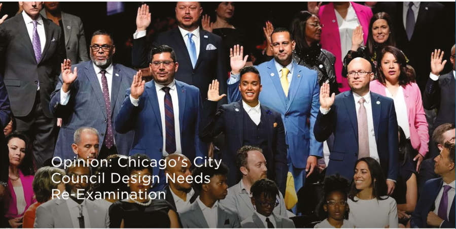
Opinion: Chicago’s City Council Design Needs Re-Examination

Chicago Public Media’s community engagement and podcast teams, as well as its music station Vocalo, will also participate with events, audio storytelling and music exploration. In turn, faculty experts, affiliated practitioners, and other partners from CEG will weigh in on the conversation and connect with policymakers, thought leaders and political leaders.